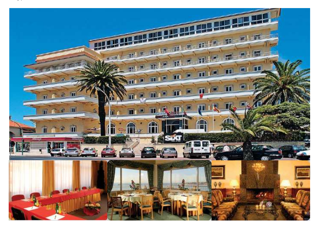
Figure 2: SANA Estoril hotel

The EURO Winter Institute on Location and Logistics was held in SANA Estoril hotel (Figure 2), a 3 star hotel close to the heart of Estoril.