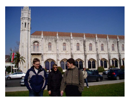
4<sup>th</sup> February: Full day free (a detail of a visit to Lisbon by a group of laureates)