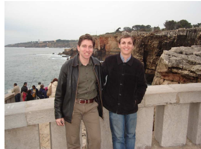
3^{\rm rd} of February (Social Program 2): Cabo da Roca and Boca do Inferno.