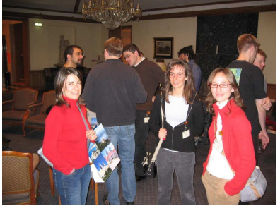
27<sup>th</sup> January: Get together.