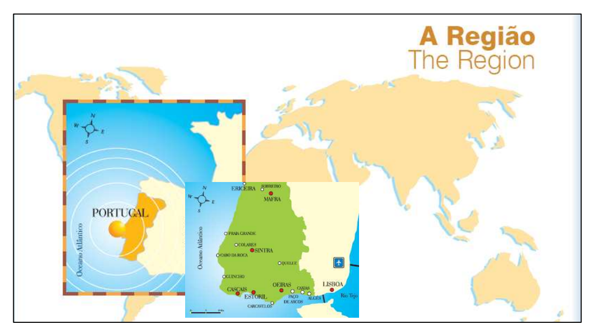
Figure 1: Estoril.

The EURO Winter Institute on Location and Logistics was held in SANA Estoril hotel (Figure 2), a 3 star hotel close to the heart of Estoril.