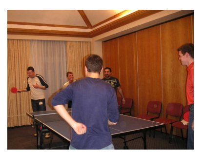
28<sup>th</sup> January: Social program 1; Table tennis (at the hotel).