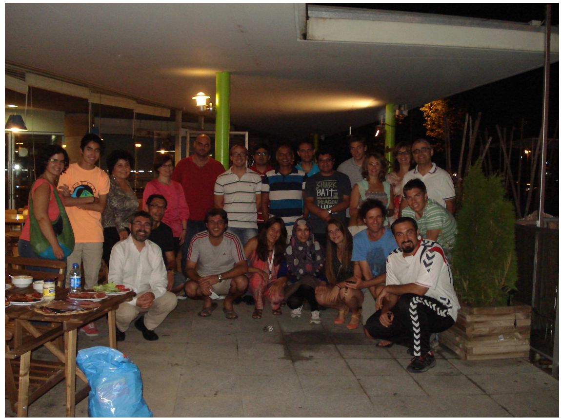
In the party with the typical dinner