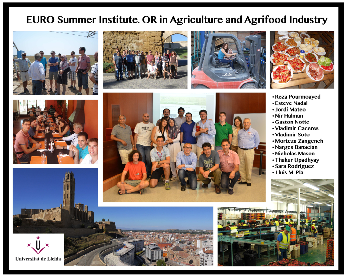
Abstract of main social activities