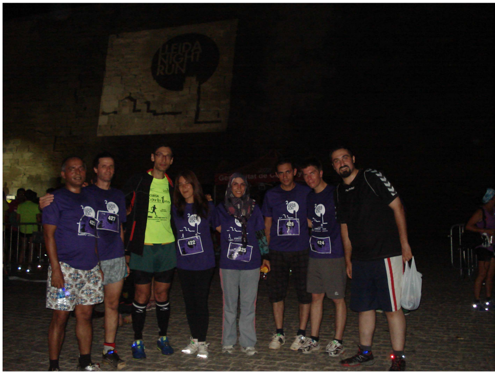
After the running competition