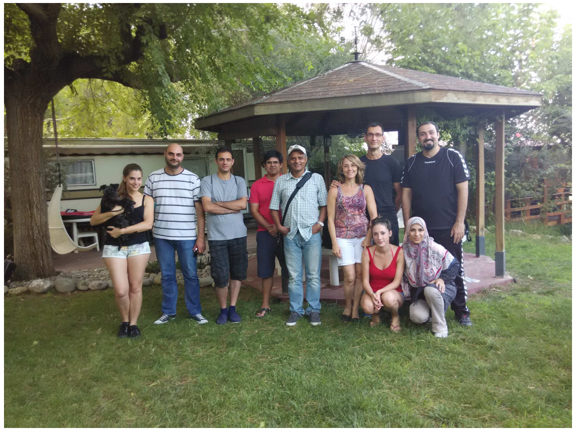
In the barbecue, the last day