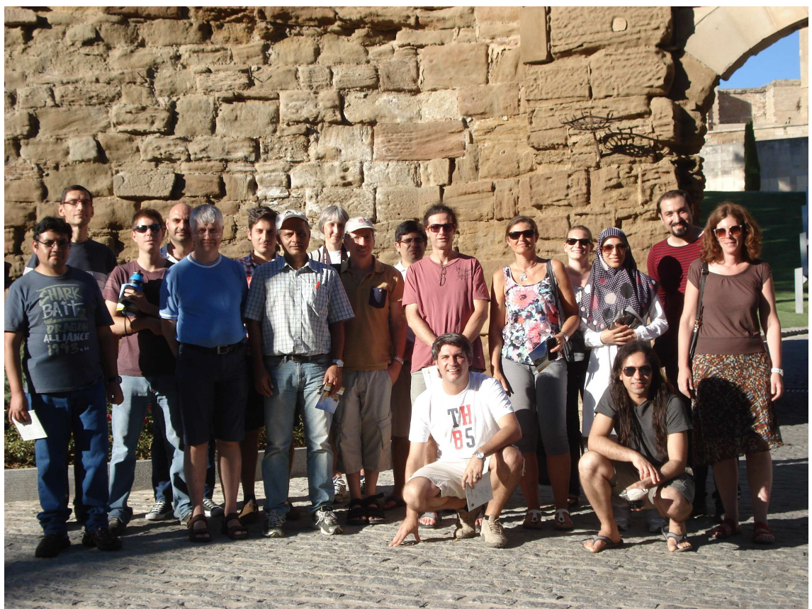
Participants visiting the Seu Vella